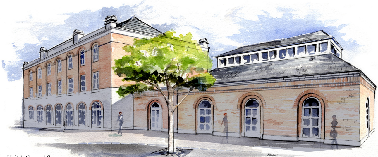
Unit 1. Ground floor with apartments above